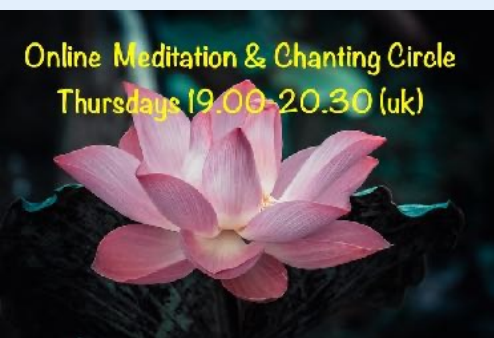
Online Meditation & Chanting Circle Thursdays 19.00-20.30 (uk)

The cost of the circle is £7.50, and you can pay by bank transfer, or PayPal using email address – info@isis-school.com . (PayPal fee is £8.00 for overseas participants. For programme details click here )